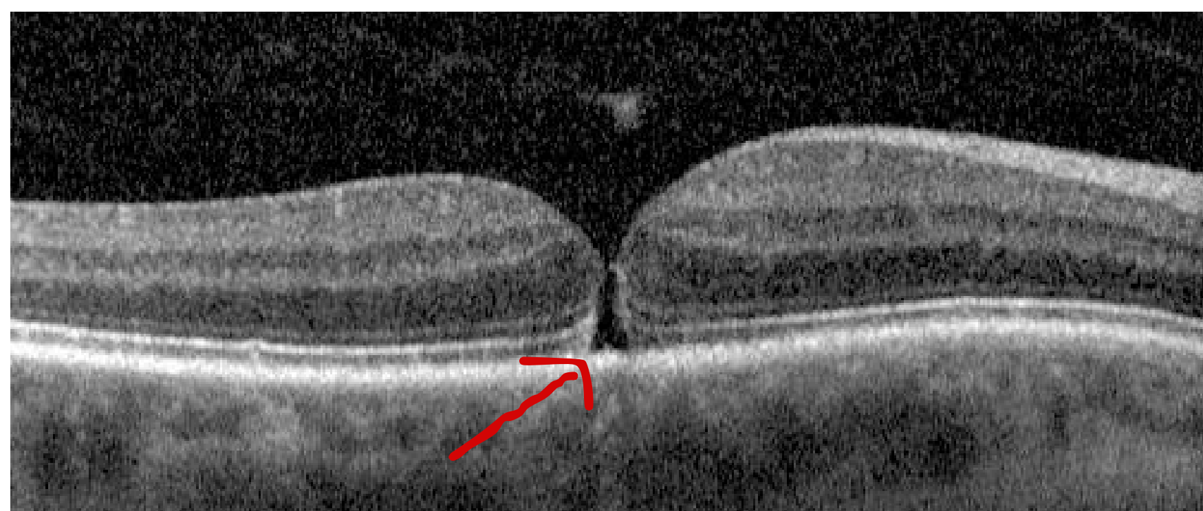
Figure 1. OCT of the right eye. The arrow indicates the small macular hole.

Visual acuity was 20/40 OD and 20/20 OS. Intraocular pressures were 17 mmHg OD and 15 mmHg OS. There was no RAPD. Examination of the posterior segment revealed a small full thickness macular hole (FTMH) in the right eye. These findings were confirmed by OCT imaging (Figure 1).